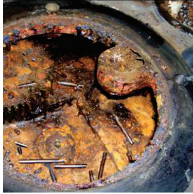
Before: Actuator prior to refurbishment.