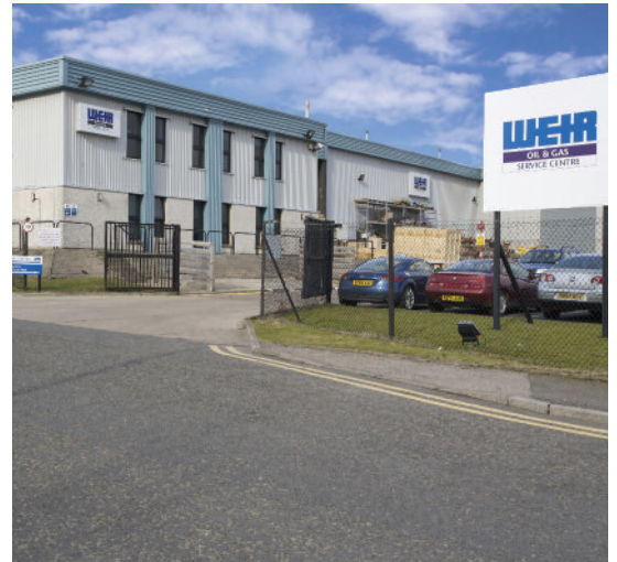
Local service centre.