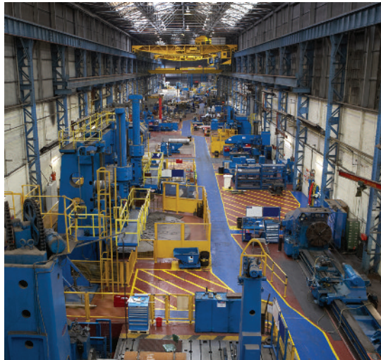
Extensive workshop capabilities.