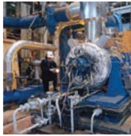
Optimum maintenance ensures operating efficiency is improved

We have the comprehensive skill set to meet a broad range of customer and process demands. We provide maintenance and service of rotating plant and associated equipment of our own products and all other major brands.