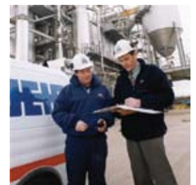
Installation & commissioning through to full site operation