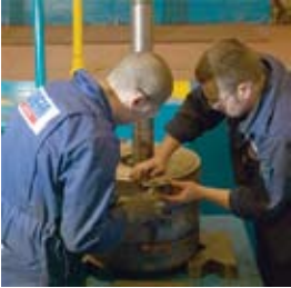
Pump cartridge being rebuilt after overhaul