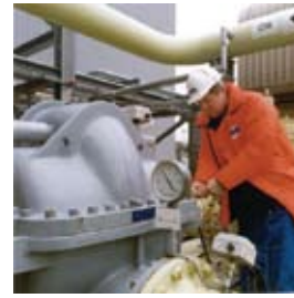
Condition monitoring is used to identify areas for improvement