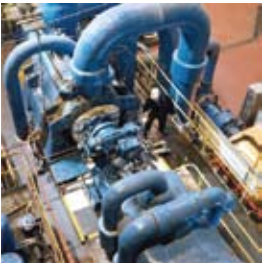
Routine inspection of main boiler feed pumps in a power station

Our service centre network is supported by design and engineering teams delivering a project management and process engineering capability and a product upgrade capability to extend repair cycles, raise operating efficiency and reduce life costs.