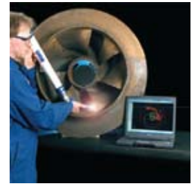
Re-engineering of parts to reduce cost and delivery times