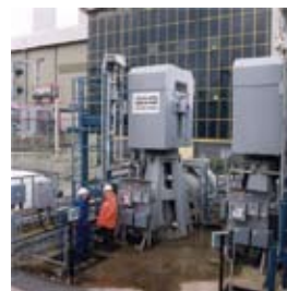
Improved plant performance reduces operating costs