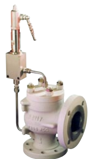
78 Series ASME Section VIII API STD 520 - STD 526 ISO 4126 Semi nozzle Pilot : Pop & modulating Sizes : 1" - 8" Set P : upto 431 barg Temp : -50°C to +250°C Mat : CS - SS - Exotic Alloy