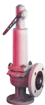
63 Series Industrial PSV ISO 4126 Semi nozzle Sizes : ¾" - 10" Set P : upto 50 barg Temp : -196°C to +350°C Mat : CS - SS