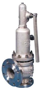
Starflow ASME Section VIII API STD 520 - STD 526 ISO 4126 Full nozzle Sizes : 1" - 12" Set P : upto 431 barg Temp : -196°C to +540°C Mat : CS - SS - Exotic Alloy