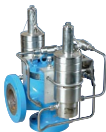
76 Series ASME Section VIII API STD 520 - STD 526 ISO 4126 Full nozzle Pilot : Pop & modulating Sizes : 1" - 12" Set P : upto 431 barg Temp : -196°C to +345°C Mat : CS - SS - Exotic Alloy