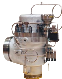
86 Series ASME Section VIII ISO 4126 Full nozzle Pilot : Pop Sizes : 1" - 8" Set P : upto 180 barg Temp : upto 550°C Mat : CS - AS - SS