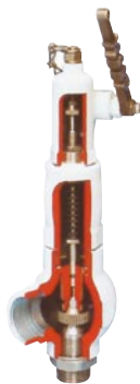
9 Series ASME Section VIII API STD 520 ISO 4126 Full nozzle Sizes : ½" - 1½" Threaded, Flanged, Welded or Clamped Set P : upto 431 barg Temp : -196°C to +400°C Mat : CS - SS - Exotic Alloy