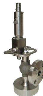
71 Series ASME Section VIII API STD 520 - ISO 4126 Full nozzle Pilot : Pop Sizes : ½" - 1½" Threaded, Flanged, Welded or Clamped Set P : upto 431 barg Temp : -50°C to +232°C Mat : CS - SS - Exotic Alloy